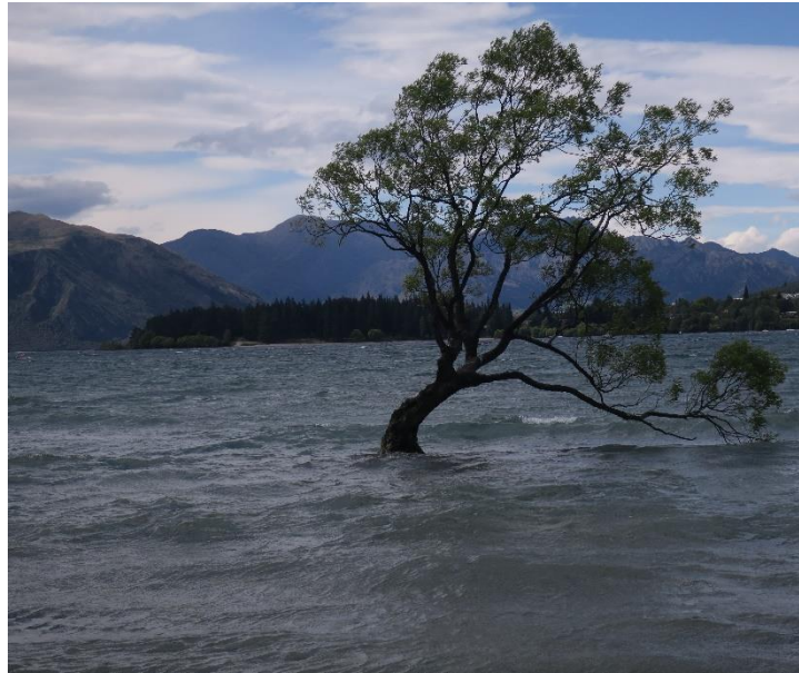
New Zealand.

But now, this is what the LORD says— he who created you, Jacob, he who formed you, Israel: